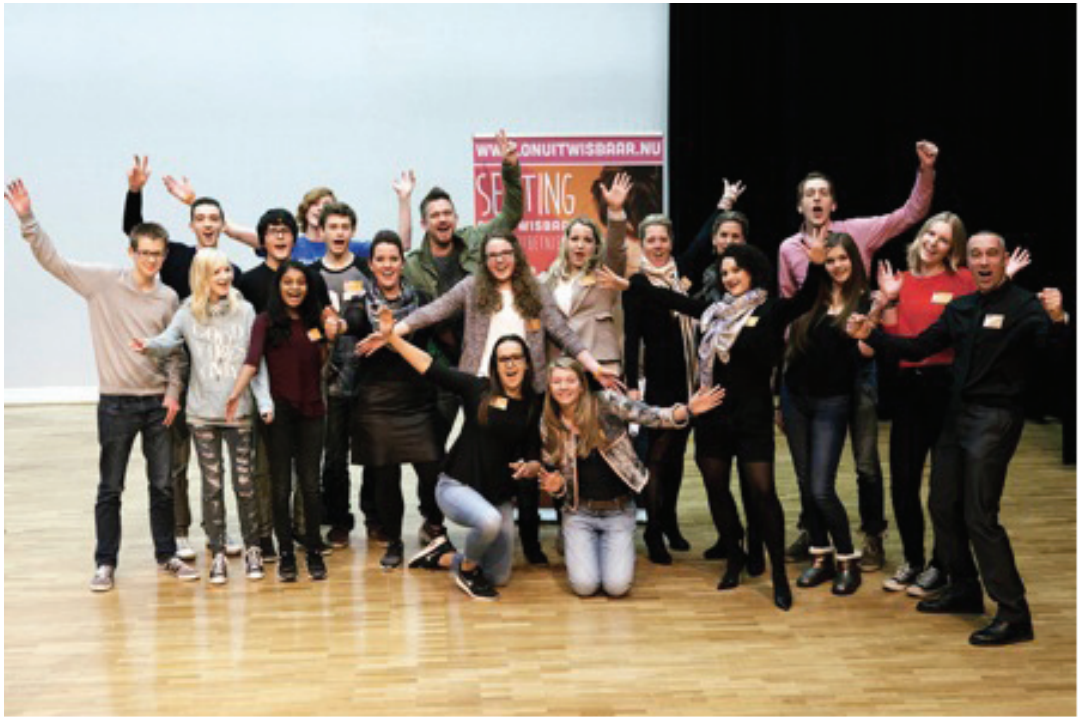
The “changemakers” of WE CAN Young Tilburg behind www.onuitwisbaar.nu .